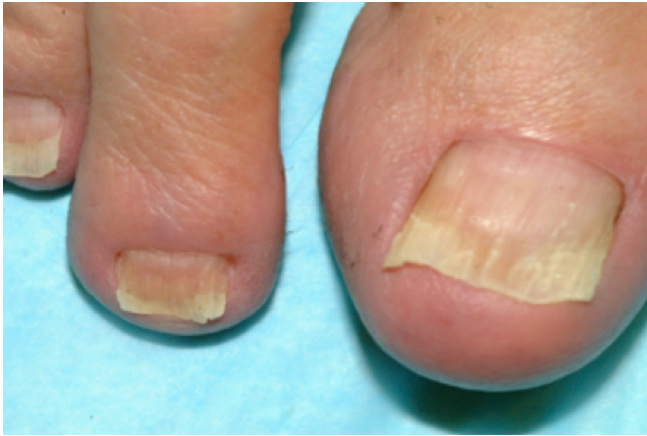
Figure 1. Toe onychomycosis. Mild - distal-lateral subungual